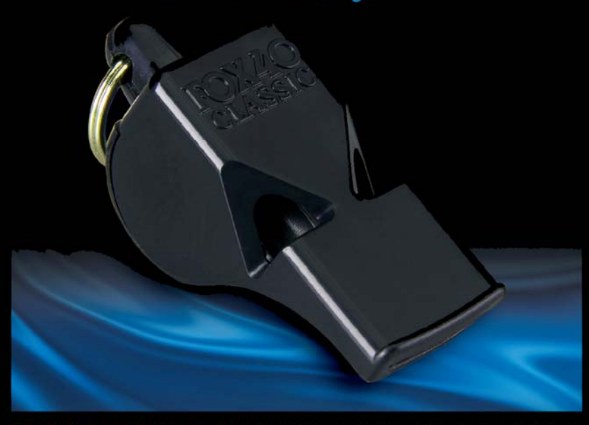
THE OFFICIAL WHISTLE OF REFEREES WORLDWIDE CLASSIC * CLASSIC CMG * MINI * MINI CMG * SONIK * PEARL