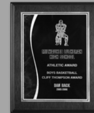
LASERED BRASS PLAQUES