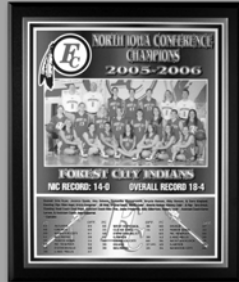
TEAM AWARD PLAQUES