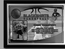
VIVID COLOR AWARDS

High-Quality Customized Award Products Since 1960