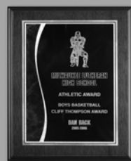
LASERED BRASS PLAQUES