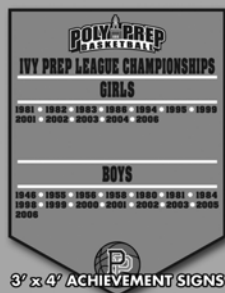
3' x 4' ACHIEVEMENT SIGNS