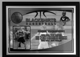
VIVID COLOR AWARDS

High-Quality Customized Award Products Since 1960