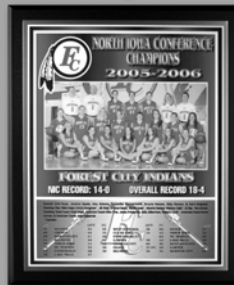
TEAM AWARD PLAQUES