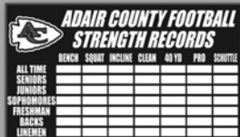
3' x 5' DRY-ERASE RECORD BOARDS