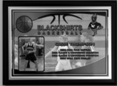
VIVID COLOR AWARDS

High-Quality Customized Award Products Since 1960