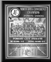
TEAM AWARD PLAQUES