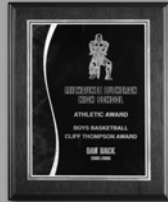
LASERED BRASS PLAQUES