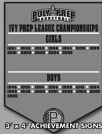
3' x 4' ACHIEVEMENT SIGNS