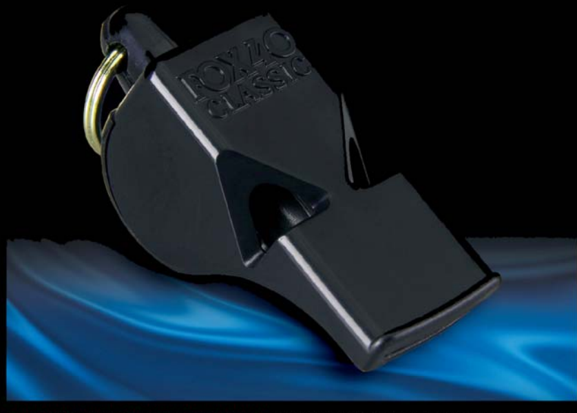
THE OFFICIAL WHISTLE OF REFEREES WORLDWIDE CLASSIC * CLASSIC CMG * MINI * MINI CMG * SONIK * PEARL