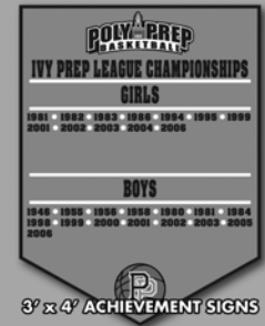
3' x 4' ACHIEVEMENT SIGNS