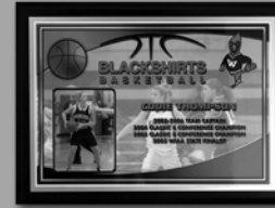
VIVID COLOR AWARDS

High-Quality Customized Award Products Since 1960