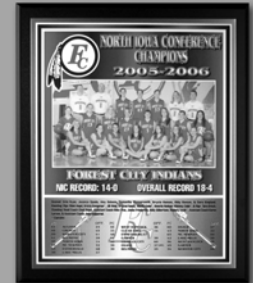
TEAM AWARD PLAQUES