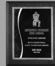
LASERED BRASS PLAQUES